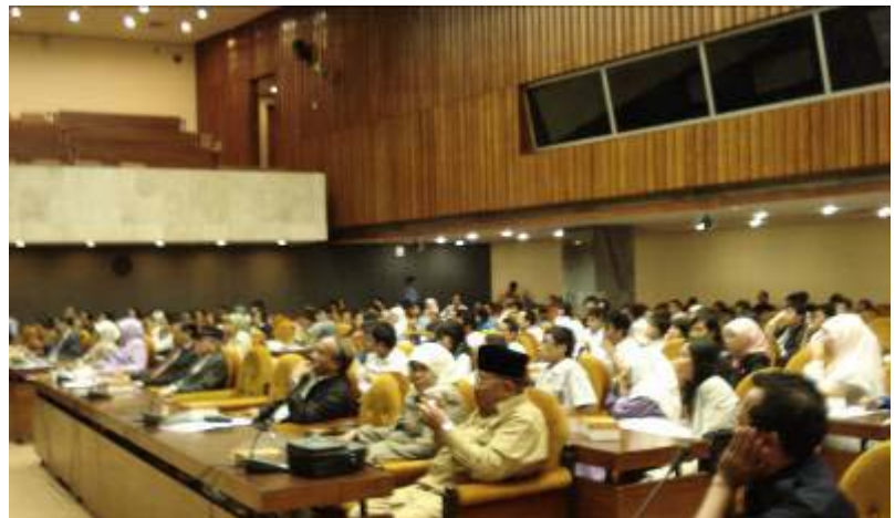
Seminar at Parliament Building March 28, 2007