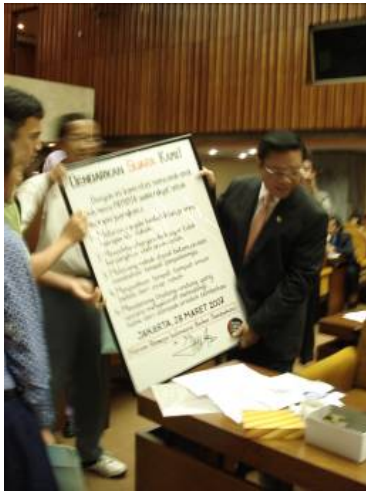
Petition from Tobacco Free Indonesian Children Forum, March 28, 2007 – accepted by Honorable HR Agung Laksono